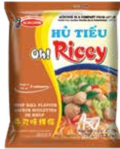
BEEF BALL FLAVOUR NetWeight: 70g