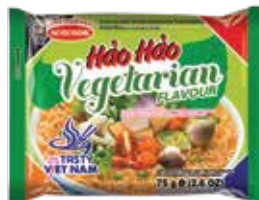
VEGETARIAN FLAVOUR NetWeight: 75g