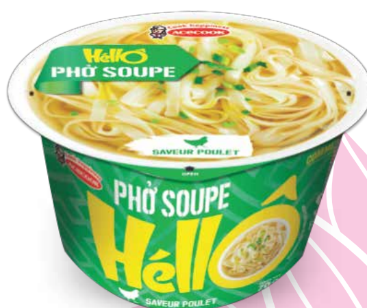
CHICKEN FLAVOUR NetWeight: 70 g