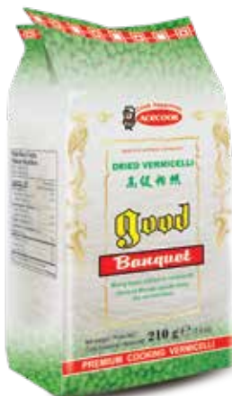
DRIED VERMICELLI NetWeight: 210g