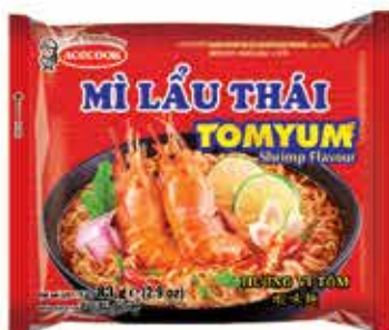
TOMYUM SHIRMP FLAVOUR NetWeight: 83g