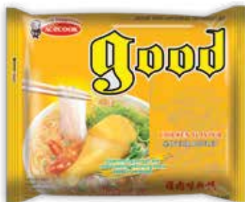
CHICKEN FLAVOUR NetWeight: 57g