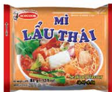
SEAFOOD FLAVOUR NetWeight: 81g