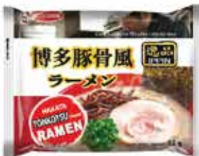
Hakata Tonkotsu Ramen NetWeight: 82g