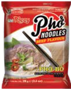
BEEF FLAVOUR NetWeight: 70g