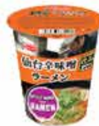
Spicy Miso Ramen NetWeight: 73g