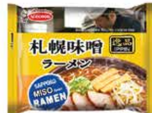
Sapporo Miso Ramen NetWeight: 80g