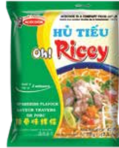
SPARERIBS FLAVOUR NetWeight: 70g