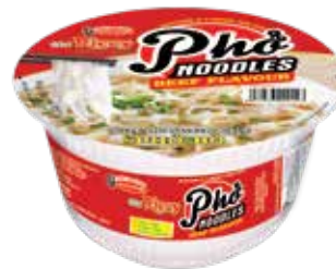
BEEF FLAVOUR NetWeight: 71g