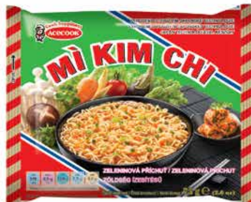
VEGETABLE FLAVOUR NetWeight: 75g