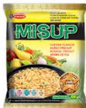
CHICKEN FLAVOUR NetWeight: 60g