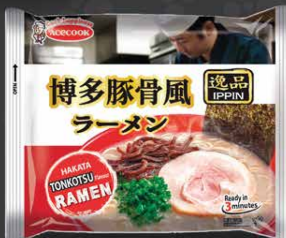
HAKATA TONKOTSU RAMEN