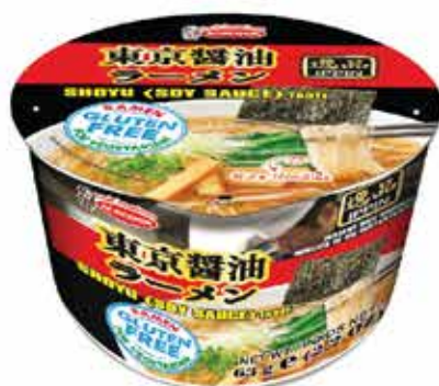
Tokyo Shoyu Ramen NetWeight: 63g