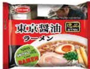
Tokyo Shoyu Ramen NetWeight: 89g