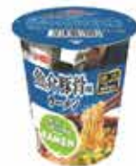
Fish Tonkotsu Ramen NetWeight: 70g