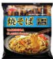
Yakisoba Classic NetWeight: 80g