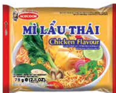
CHICKEN FLAVOUR NetWeight: 78g