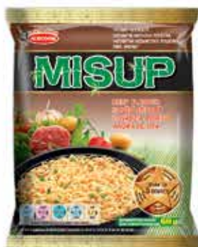
BEEF FLAVOUR NetWeight: 60g