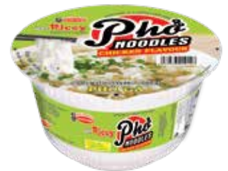
CHICKEN FLAVOUR NetWeight: 71g