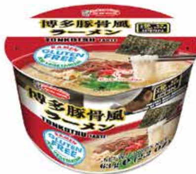
Hakata Tonkotsu Ramen NetWeight: 63g