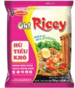
GARLIC & PHNOM PENH STYLE NetWeight: 73g