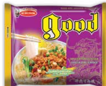
MINCED PORK FLAVOUR NetWeight: 57g