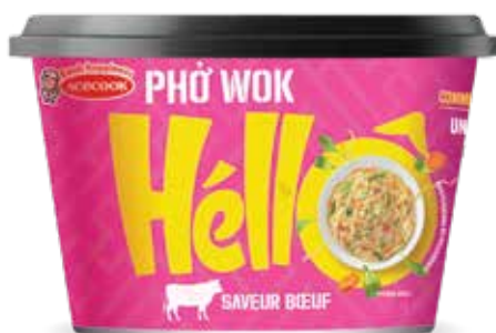
BEEF FLAVOUR NetWeight: 76 g