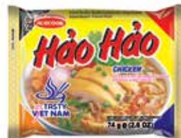
CHICKEN FLAVOUR NetWeight: 74g