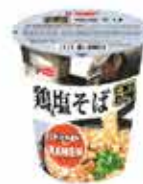
Shio Chicken Ramen NetWeight: 70g