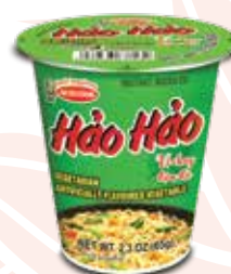
VEGETARIAN FLAVOUR NetWeight: 65g