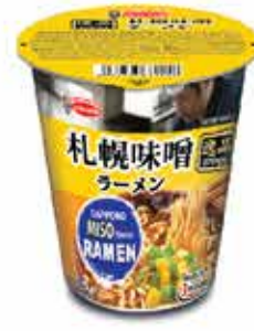
Sapporo Miso Ramen NetWeight: 73g