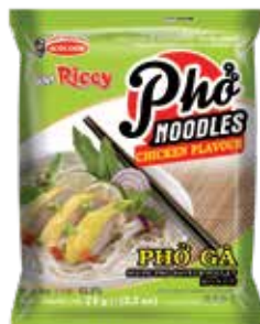
CHICKEN FLAVOUR NetWeight: 71g