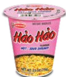
HOT & SOUR SHRIMP FLAVOUR NetWeight: 70g