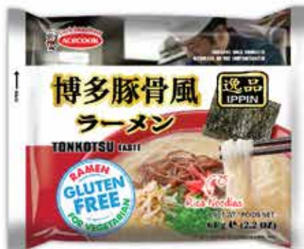
Hakata Tonkotsu Ramen NetWeight: 61g