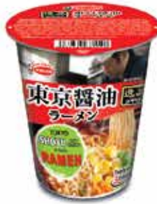
Tokyo Shoyu Ramen NetWeight: 73g