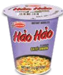
SASTE ONION FLAVOUR NetWeight: 65g