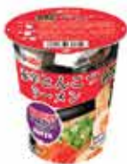
Red Spicy Tonkotsu Ramen NetWeight: 73g