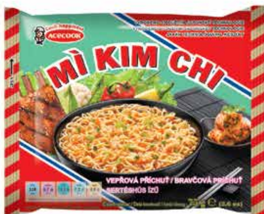
PORK FLAVOUR NetWeight: 75g