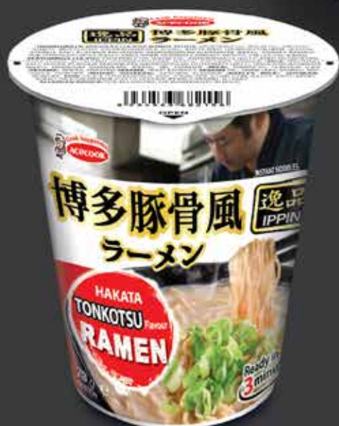
HAKATA TONKOTSU RAMEN