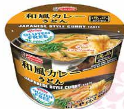
Japanese Style Curry Udon NetWeight: 63g