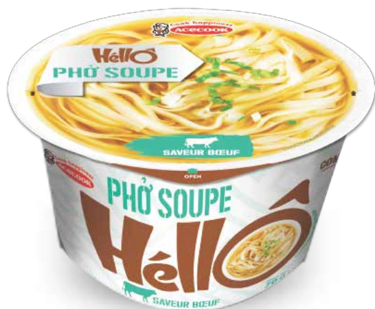
BEEF FLAVOUR NetWeight: 70 g