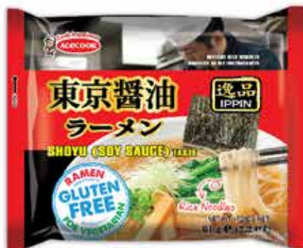
Tokyo Shoyu Ramen NetWeight: 61g