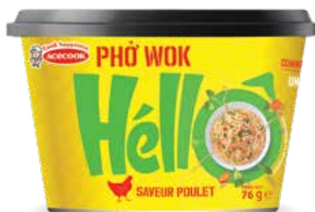
CHICKEN FLAVOUR NetWeight: 76 g