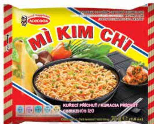
CHICKEN FLAVOUR NetWeight: 75g