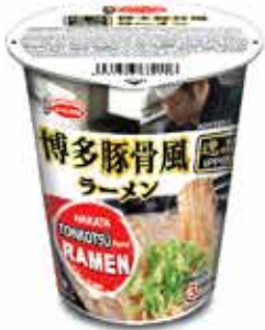
Hakata Tonkotsu Ramen NetWeight: 73g