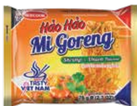
SHRIMP ONION FLAVOUR NetWeight: 76g