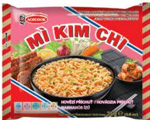
BEEF FLAVOUR NetWeight: 75g