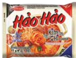
KIMCHI FLAVOUR NetWeight: 77g