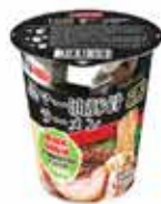
Black Garlic Tonkotsu Ramen NetWeight: 73g