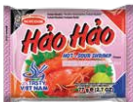
HOT & SOUR SHRIMP FLAVOUR NetWeight: 77g