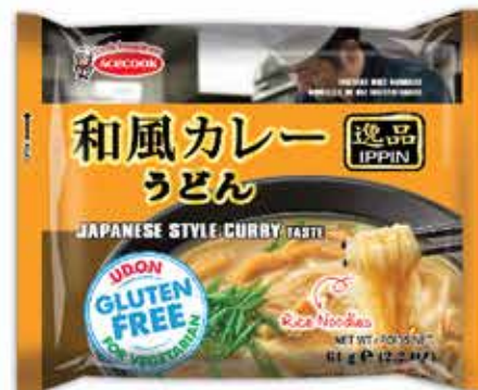
Japanese Style Curry Udon NetWeight: 61g