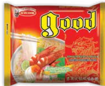
TOM YUM KUNG FLAVOUR NetWeight: 62g