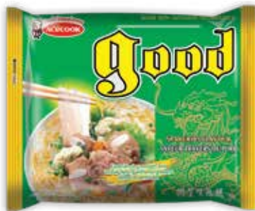
SPARERIBS FLAVOUR NetWeight: 56g