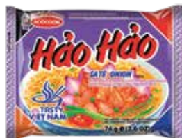
SASTE ONION FLAVOUR NetWeight: 74g