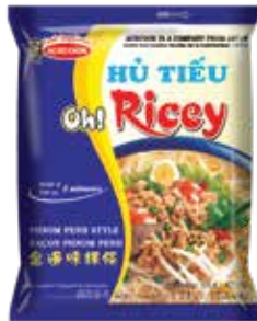
PHNOM PENH FLAVOUR NetWeight: 71g