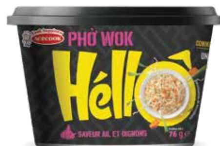
GARLIC & ONION FLAVOUR NetWeight: 76 g