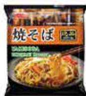
Yakisoba Teriyaki NetWeight: 80g