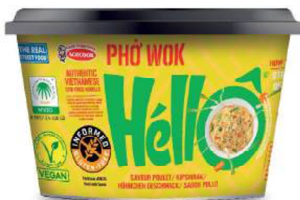
CHICKEN FLAVOUR Net Weight: 76 g