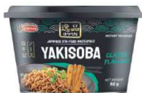
Yakisoba - Classic Net Weight: 92g