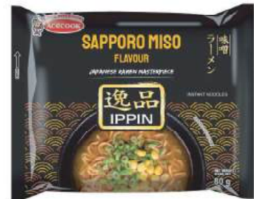
Sapporo Miso Ramen Net Weight: 80g