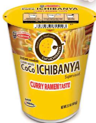
CURRY RAMEN NET WEIGHT: 63 G