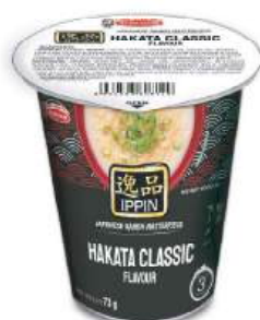
Hakata Classic Ramen Net Weight: 73g