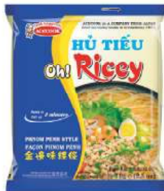
PHNOM PENH FLAVOUR NetWeight: 71g