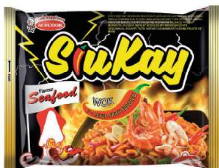
SEAFOOD Flavour Net Weight: 127 g