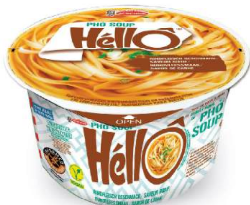
BEEF FLAVOUR Net Weight: 70 g