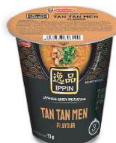
Tan Tan Men Ramen Net Weight: 73g