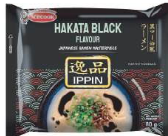
Hakata Black Ramen Net Weight: 80g