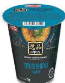
Tokyo Shoyu Ramen Net Weight: 73g