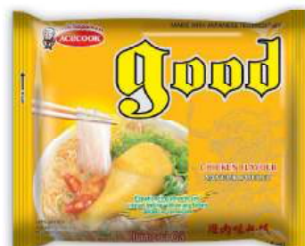
CHICKEN FLAVOUR NetWeight: 57g