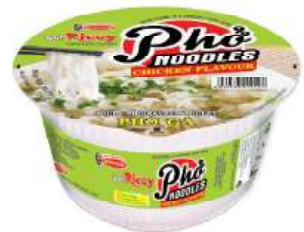
CHICKEN FLAVOUR NetWeight: 71g