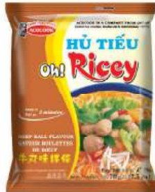
BEEF BALL FLAVOUR NetWeight: 70g