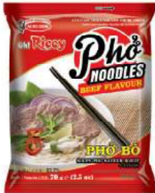
BEEF FLAVOUR NetWeight: 70g