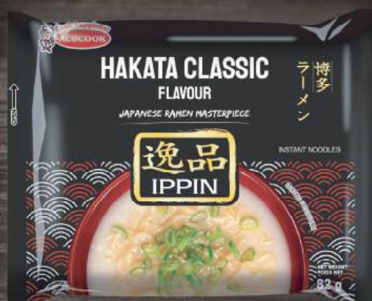
HAKATA CLASSIC RAMEN