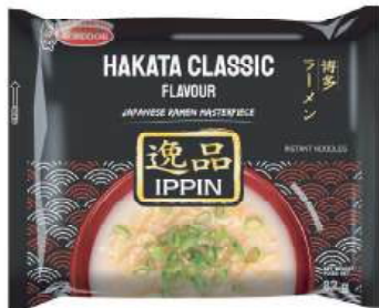
Hakata Classic Ramen Net Weight: 82g