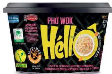
GARLIC & ONION FLAVOUR Net Weight: 76 g