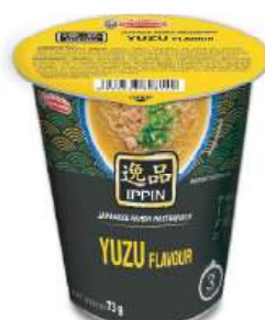
Yuzu Ramen Net Weight: 73g