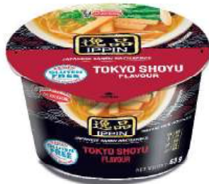
Tokyo Shoyu Net Weight: 63g