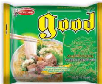
SPARERIBS FLAVOUR NetWeight: 56g