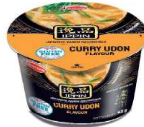
Curry Udon Net Weight: 63g