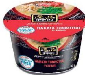
Hakata Tonkotsu Net Weight: 63g