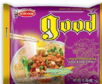
MINCED PORK FLAVOUR NetWeight: 57g