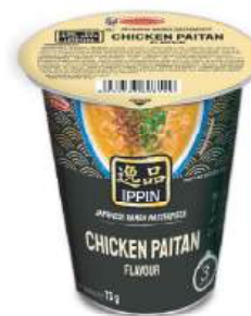
Chicken Paitan Ramen Net Weight: 73g