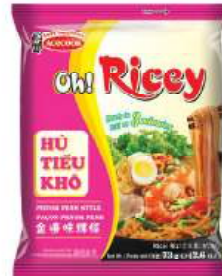
GARLIC & PHNOM PENH STYLE NetWeight: 73g