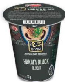
Hakata Black Ramen Net Weight: 73g