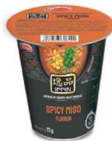
Spicy Miso Ramen Net Weight: 73g