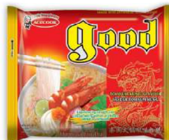
TOM YUM KUNG FLAVOUR NetWeight: 62g