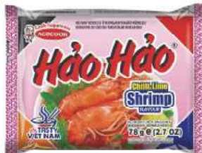
CHILLI & LIME SHRIMP FLAVOUR Net Weight: 78g