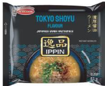
Tokyo Shoyu Ramen Net Weight: 83g