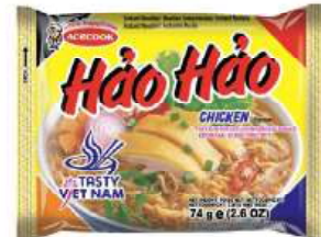
CHICKEN FLAVOUR Net Weight: 74g