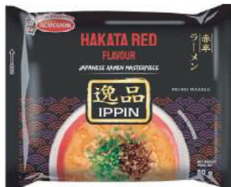
Hakata Red Ramen Net Weight: 80g