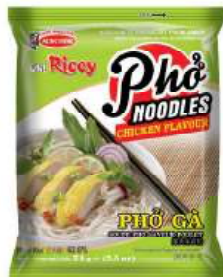
CHICKEN FLAVOUR NetWeight: 71g