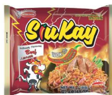
BEEF Flavour Net Weight: 127 g