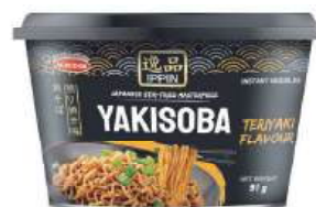
Yakisoba - Teriyaki Net Weight: 91g