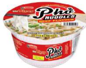
BEEF FLAVOUR NetWeight: 71g