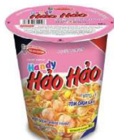
HOT & SOUR SHRIMP FLAVOUR Net Weight: 68g