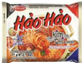
KIMCHI FLAVOUR Net Weight: 77g