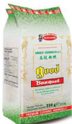
DRIED VERMICELLI NetWeight: 210g