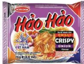
CHILLI CRISPY ONION FLAVOUR Net Weight: 75g