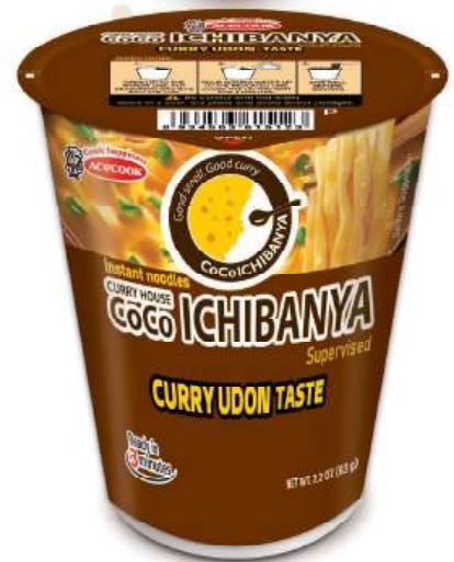
CURRY UDON NET WEIGHT: 63 G