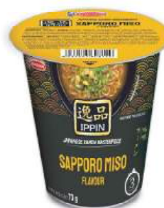
Sapporo Miso Ramen Net Weight: 73g