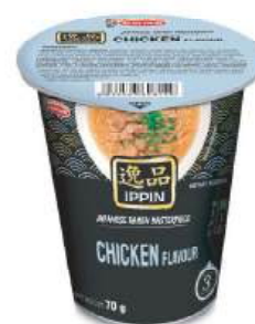
Chicken Ramen Net Weight: 70g