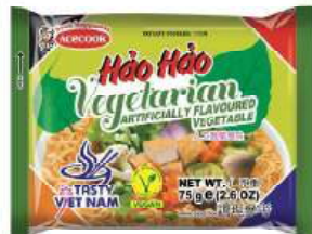
VEGETARIAN FLAVOUR Net Weight: 75g