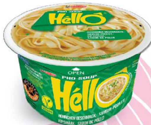
CHICKEN FLAVOUR Net Weight: 70 g