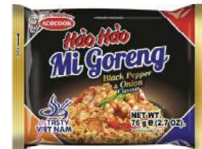
BLACK PEPPER & ONION FLAVOUR Net Weight: 76g