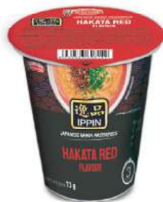
Hakata Red Ramen Net Weight: 73g