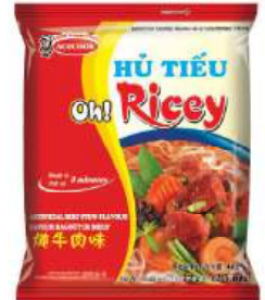
BEEF STEW FLAVOUR NetWeight: 72g