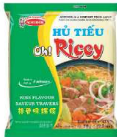
RIBS FLAVOUR NetWeight: 70g