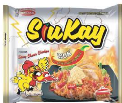
SPICY CHEESE CHICKEN Flavour Net Weight: 127 g