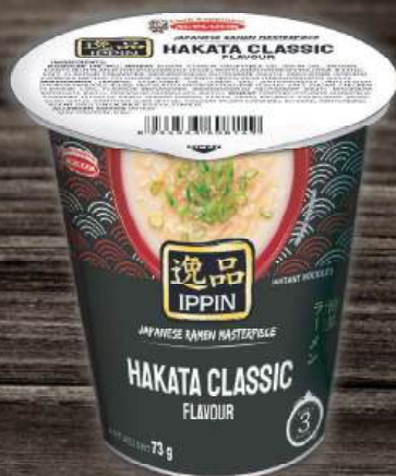
HAKATA CLASSIC RAMEN